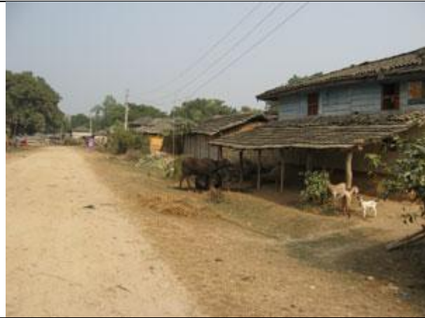
Village High Street

While in the village near Dhalkebar we had the opportunity to visit the local junior school. The headmaster, Upendra Mahatto, had founded this under a tree in a field in 1992. Sometime later a small hut was built, this still exists and can be seen as a white building in the photo. Later still a Japanese group helped them to build two more larger structures. The resources are very poor and we have decided to try to help as this is in the area that we have targeted our aid.