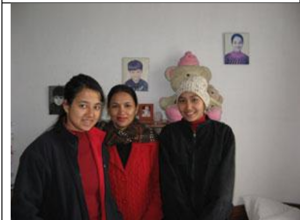
Inside the house