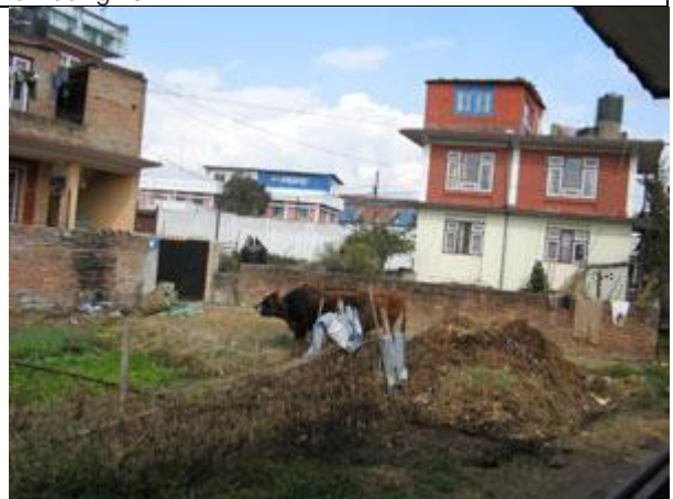
Outside the house, still rural in the city