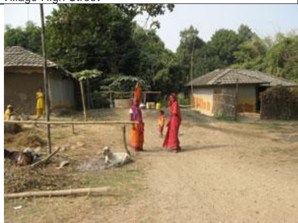
By the well