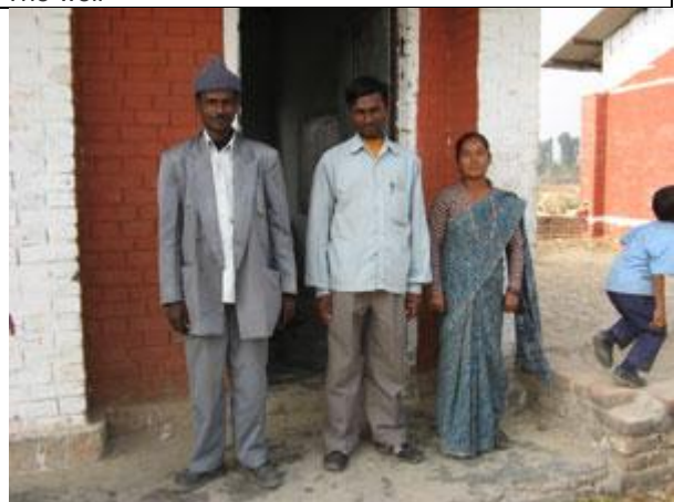
The headmaster with his staff