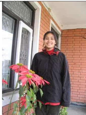
Outside the house in Kathmandu, this will be the home for four girls